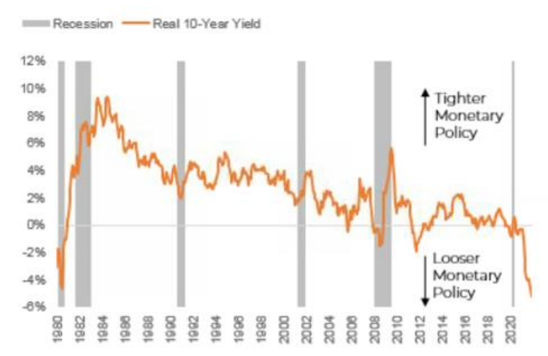
Shaded areas represent recessions as dated by the National Bureau of Economic Research (NBER). Real: Inflation-adjusted. Source: Federal Reserve, NBER, Bureau of Labor Statistics, IHS Markit. O'Brien Wealth Partners. as of 11/30/21.

Internationally, while the U.S. economy led the way in 2021 we expect 2022 growth will be driven more evenly around the world as the pace of domestic activity moderates. In many developed markets fiscal policymakers continue to inject stimulus, while fiscal policy has become a headwind in the U.S. And while China's "Common Prosperity" agenda weighed down emerging market growth and returns last year, policymakers there are now starting to ease policy on the margin. Recent economic data in China have started to surpass subdued market expectations as a result.